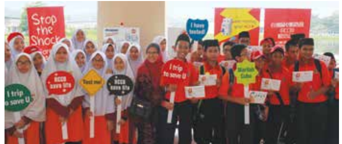
Safety awareness in UPM – Students being briefed on home electrical safety.